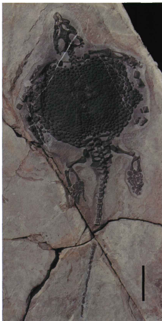
Fig. 1 Glyphoderma kangi gen. et sp. nov. (ZMNH M 8729, holotype), scale bar = 10 cm

The shape of the carapace is similar to that of Psephochelys . The carapaces of both taxa have a rounded contour, interrupted only by an anterior nuchal excavation and a biconcave posterior margin (Fig. 3). However, the nuchal excavation of Glyphoderma is less concave and much more open than that of Psephochelys . The carapace of Glyphoderma is formed by more than 400 hexagonal and pentagonal osteoderms tightly sutured with each other, but the contacts among the osteoderms are not as firm as those in Psephochelys , in which the carapace is a solid structure with the osteoderms fused completely. At the periphery of the carapace of Glyphoderma , the osteoderms (also including those from the lateral wall) are isolated from one another and have evidently shifted from their original positions. At the lateral margins of the nuchal excavation of the carapace, there are two slightly enlarged osteoderms, but they are less obvious