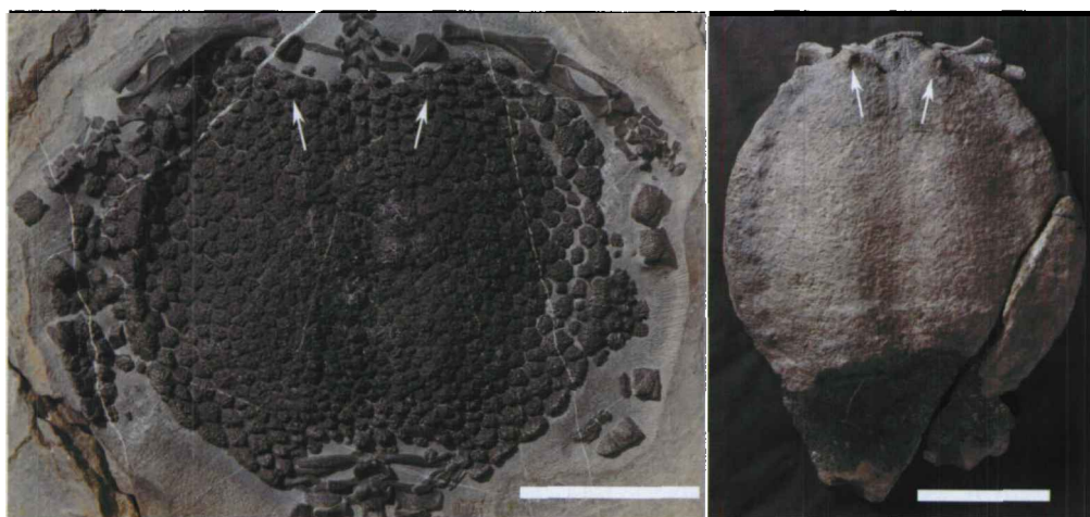
Fig. 3 Capital comparison between the carapace of Glyphoderma kangi gen. et sp. nov. (left, ZMNH M 8729, holotype) and that of Psephochelys polyosteoderma (right, IVPP V 12442) The arrow shows the two enlarged (tuberculiform in Psephochelys ) osteoderms that flank the nuchal excavation in each taxon; scale bars = 10 cm

than in Psephochelys . As in Psephochelys , the dorsal surface of the carapace is moderately convex with a shallow longitudinal groove along the midline. The structure of the osteoderms clearly