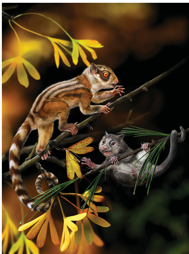
Reconstruction of the arboreal Shenshou and Xianshou from the extinct mammal group of Euharamiyida that had lived in the Jurassic forests. The fossils were found in north-eastern China (Image credit: Chuang Zhao).

Xiao: Yes. The Chengjiang Biota is unique in its preservation of various species representing numerous animal phyla that have never been seen in older rocks. The geologically abrupt appearance of animal phyla has been popularly known as the Cambrian Explosion or Cambrian Radiation. The Chengjiang Biota enables us to understand animal evolution in greater details during