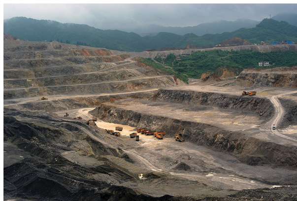
An important Precambrian fossil site turned into one of the largest phosphate mines in China.

not the cause leading to the extinction. The asteroid impact occurred in very short period while the extinction lasted millions of years in view of the stratigraphic ranges of the fossils. In fact, the extinction pattern may not be so accurate, since we now know many dinosaurs became extinct before the impact event, and some of them were early birds evolving to modern birds.