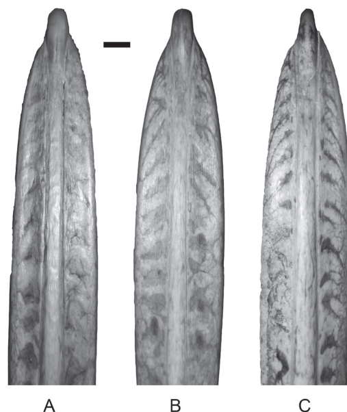
Figure 1. Dorsal view of the rostral end of the bill of the Spot-billed Pelican ( Pelecanus philippensis ), illustrating the presence of spots. Specimens are from the research collections of the Institute of Zoology (IOZ) of the Chinese Academy of Sciences in Beijing (A. IOZ 21030; B. IOZ 21033; C. IOZ 44412; Scale bar = 1 cm).

Four specimens with locality and collection information out of the 11 pelican skins and mounted specimens in the IOZ can be verified to be of Spot-Billed Pelicans. An additional two specimens appear to have spotted bills, but their locality information appears erroneous or at least questionable. Specimen IOZ 44412 is an individual collected 20 September 1963 in Meihua, Fujian Province (Fig. 2). The original specimen label identifies the individual as a juvenile female of " Pelecanus r. roseus ," and she may be the specimen from Fujian Province reported by BirdLife International (2001, p. 102). It is likely that this individual is the historically latest known specimen of this species from China. Specimens IOZ 21032 and 21033 are two unsexed study skins collected in 1897 (no calendar date known) from Fuzhou in Fujian Province (Fig. 2). Both specimens are labeled separately as " P. r. roseus " and " P. philippensis " originally from "E. Mus. Huede" and donated by Mr. de la