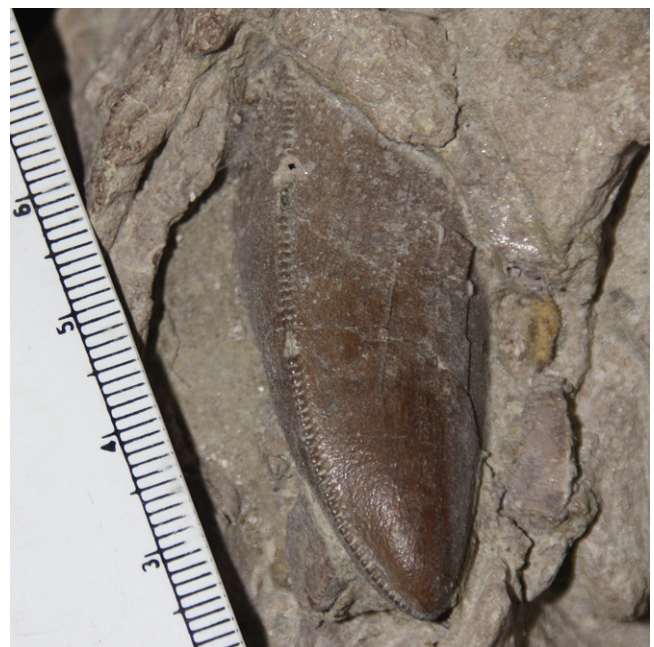
Fig. 5. First right maxillary tooth of Zhuchengtyrannus magnus (ZCDM V0031) in lingual view. Note lingual twist of the mesial carina.