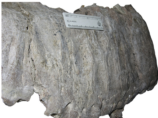
Fig. 4. Low-angle photograph of lateral face of right maxilla of Zhuchengtyrannus magnus (ZCDM V0031). Note the pronounced sculpting of the surface.

The palatal shelf extends posteriorly from the anterior shelf at a level about 30 mm below the antorbital fenestra. The anterior confluence of the two shelves forms a sub-triangular mass of bone whose damaged medial surface would have formed a sutural area for the contralateral maxilla, dorsal to the overlapping vomer. The