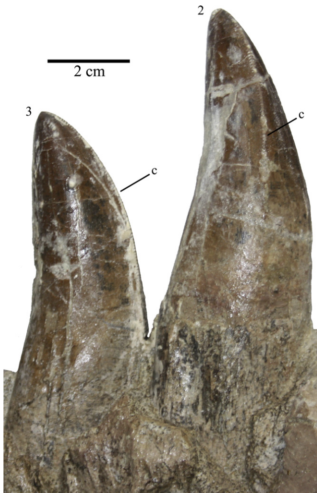
Fig. 6. Second and third right dentary teeth of Zhuchengtyrannus magnus (ZCDM V0031) in lingual view. Note the lingual placement of the mesial carina. Abbreviation: c, mesial tooth carina. Numerals indicate tooth positions.

The lateral face of the dentary is slightly convex from dorsal to ventral. As in other tyrannosaurids, two distinct longitudinal rows of foramina are present on the lateral face, one near the dorsal