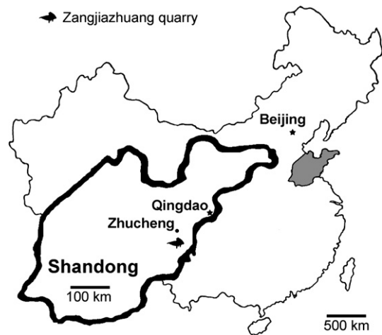
Fig. 1. Map showing location of Zangjiazhuang quarry near Zhucheng, Shandong Province, China.

A large tyrannosaurine theropod dinosaur distinguished from other tyrannosaurine taxa by the following features of the maxilla: a horizontal shelf on the lateral surface of the base of the ascending process, and a rounded notch in the anterior margin of the maxillary fenestra. Zhuchengtyrannus magnus also possesses the following unique combination of characters: the ventral margin of