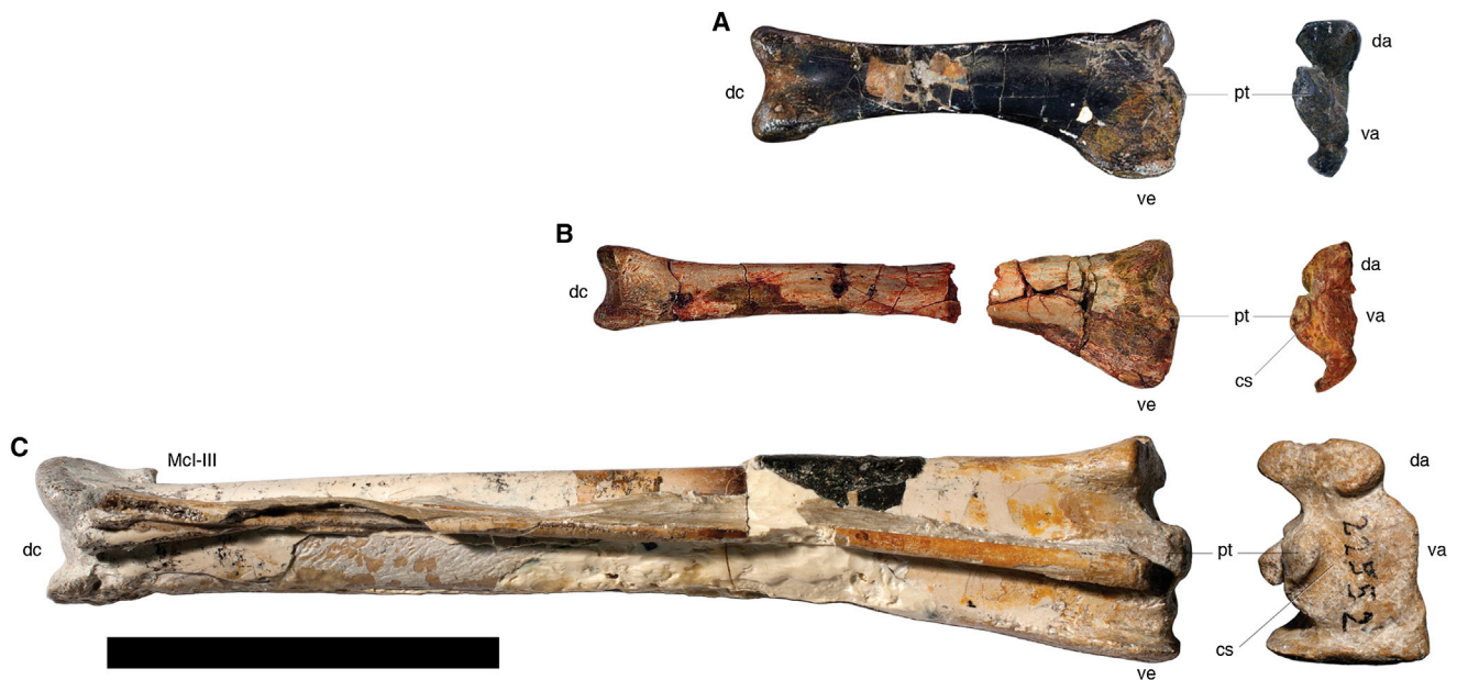
Figure 2. Comparison of Three-Dimensionally Preserved Pterosaur Wing Metacarpals Illustrating the Character States of Nonpterodactyloid and Pterodactyloid Pterosaurs in Anterior and Proximal Views

(A) Nonpterodactyloid Comodactylus ostromi Galton 1981 (YPM 9150), courtesy of the Yale Peabody Museum of Natural History.