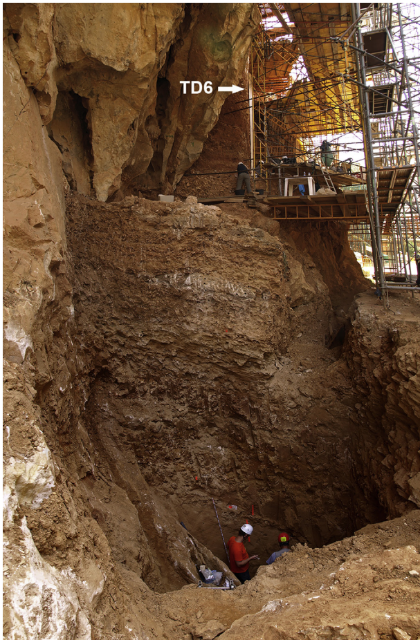
Fig. 1. The Gran Dolina cave site is about 27 m deep. The lower two thirds of the sequence belong to the Lower Pleistocene. A test pit made between 1993 and 1999, as well as a vertical cut of the entire sequence allowed to find the human fossils from the TD6 level (see arrow and Fig. 2).

possibly complementary hypotheses (e.g. Bermúdez de Castro et al., 2003; Martínón-Torres et al., 2007; Bermúdez de Castro et al., 2008a,b; Endicott et al., 2010; Martínón-Torres et al., 2011; McDonald et al., 2012; Bermúdez de Castro and Martínón-Torres, 2013).